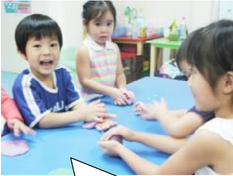
Nursery and Kindergarten classroom: Learning about shapes with Play-Doh