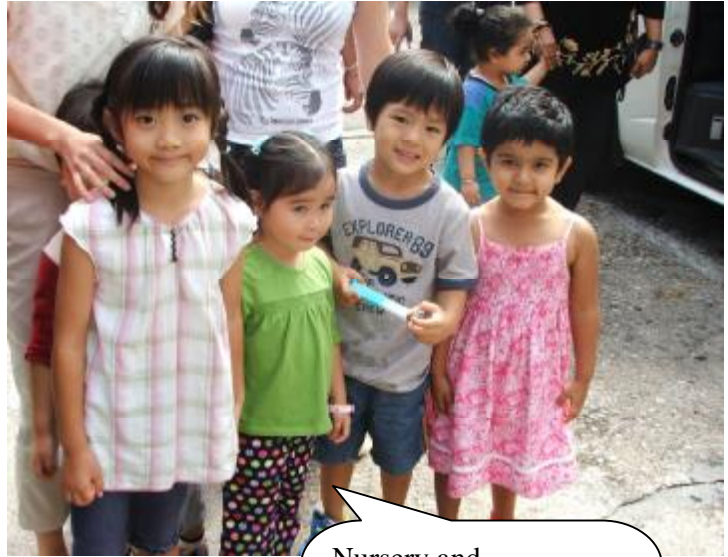
Nursery and Kindergarten field trip, June 23: Getting on the ASB school bus to go to A Little Something cooking school